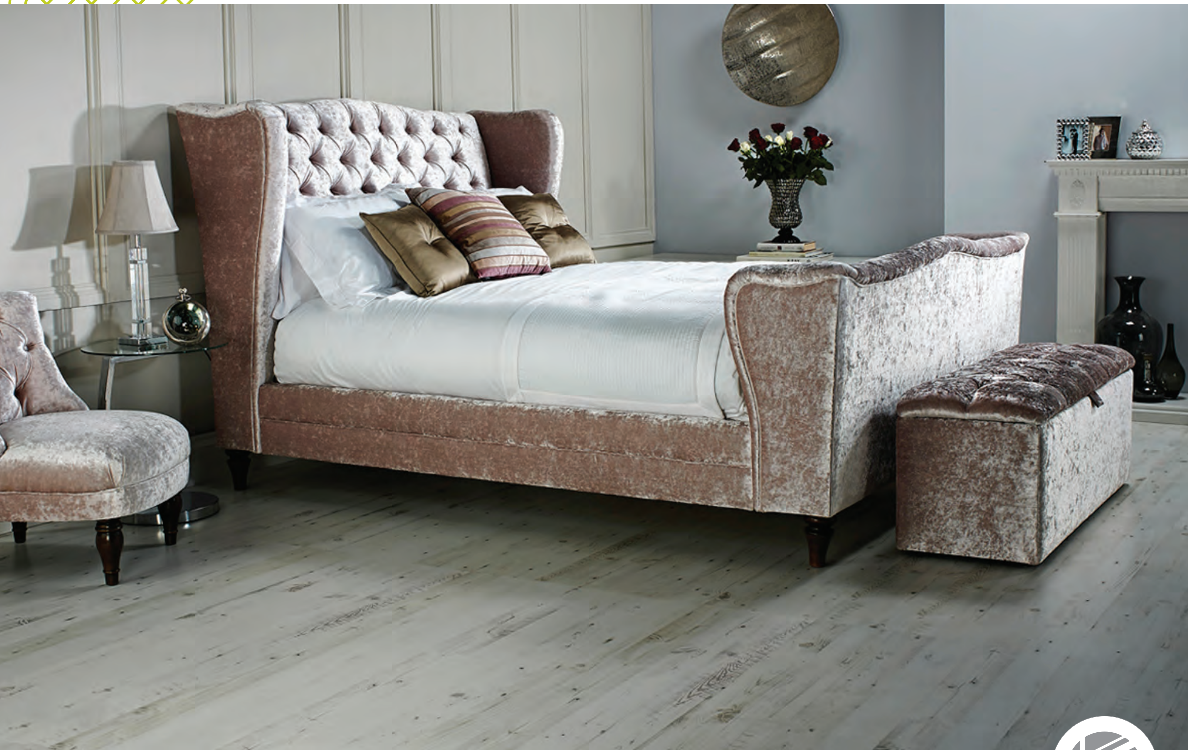
5'0" King Size Bed: Fabric 1: Indulgence Pearl