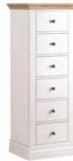
6 Drawer Tallboy 204

Single hanging rail. Internal top shelf. H1970 x W1105 x D565 mm H77½ x W43½ x D22¼ in