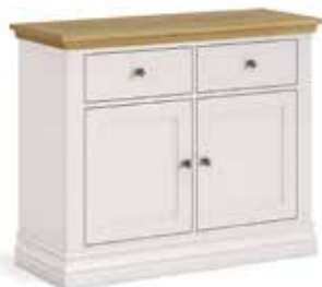
Small Sideboard L135

One fixed shelf in each cupboard. H860 x W1475 x D425 mm H33¾ x W58 x D16¼ in