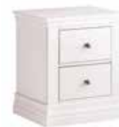
2 Drawer Bedside Chest 200

Fabric choice available. H450 x W485 x D365 mm H17¼ x W19 x D14½ in