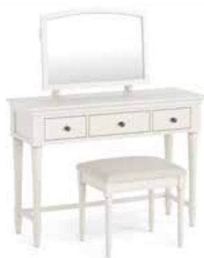
Dressing Table & Mirror Set 216

H1680 x W710 x D440 mm H66¼ x W28 x D17¼ in