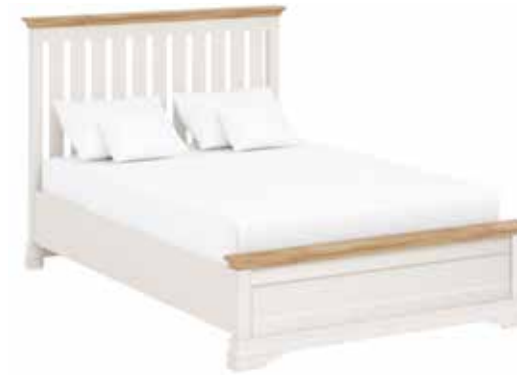
Imperial Bed Double LFE (4'6'') 241

H1250 x W1635 x L2185 mm H49¼ x W64¼ x L86 in