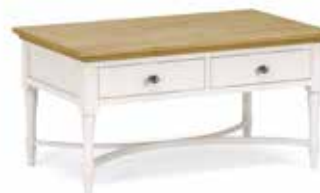
Coffee Table with Drawer L141

H550 x W450 x D420 mm H21¼ x W17¾ x D16½ in