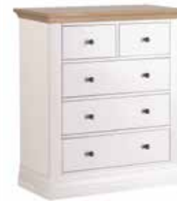
2+3 Drawer Chest 196

H620 x W470 x D390 mm H24½ x W18½ x D15¼ in