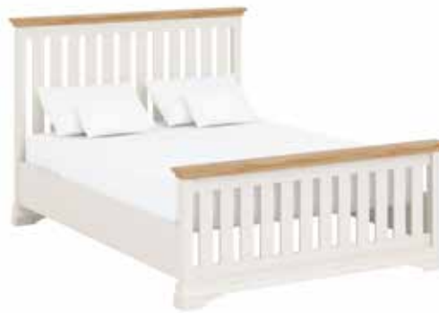
Imperial Bed King Size HFE (5') 242

H820 x W1240 x D430 mm H32¼ x W48¾ x D17 in