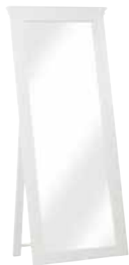
Cheval Mirror 178

H620 x W470 x D390 mm H24½ x W18½ x D15½ in