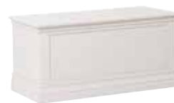
Blanket Box 220

H820 x W1240 x D430 mm H32¼ x W48¼ x D17 in