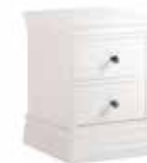
Narrow Bedside Chest 201

H610 x W530 x D425 mm H24 x W20¼ x D16¼ in