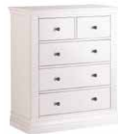
2+3 Drawer Chest 196

H1440 x W530 x D425 mm H56¼ x W20¼ x D16¼ in