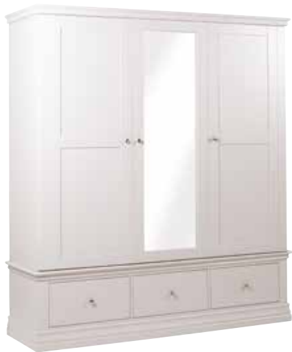
Triple Wardrobe with 3 Drawers 225

Two hanging rails. Two internal top shelves. H2020 x W1800 x D565 mm H79½ x W70¼ x D22¼ in