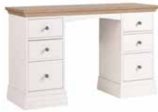
Double Pedestal Dressing Table 219

Only sold as a set. Dressing Table Mirror H810 x W1100 x D450 mm H500 x W700 x D50 mm H31¾ x W43¼ x D17¾ in H19¾ x W27½ x D2 in