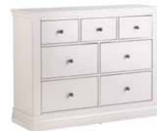
3+4 Drawer Chest 199

H1020 x W890 x D425 mm H40¼ x W35 x D16¼ in