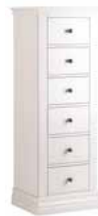
6 Drawer Tallboy 204

Single hanging rail. Internal top shelf. H1970 x W1105 x D565 mm H77½ x W43½ x D22¼ in