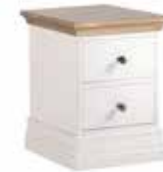
Narrow Bedside Chest 201

H610 x W530 x D425 mm H24 x W20¾ x D16¾ in