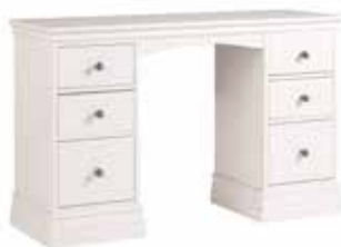
Double Pedestal Dressing Table 219

Only sold as a set. Dressing Table H810 x W1100 x D450 mm Mirror H500 x W700 x D50 mm H31¼ x W43¼ x D17¼ in H19¼ x W27½ x D2 in