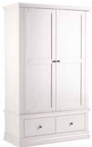
Double Wardrobe with 2 Drawers 223

Two hanging rails. Two internal top shelves. H2020 x W1800 x D565 mm H79½ x W70¼ x D22¼ in