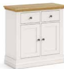
Mini Sideboard L136

One fixed shelf. H860 x W1040 x D400 mm H33¾ x W41 x D15¼ in