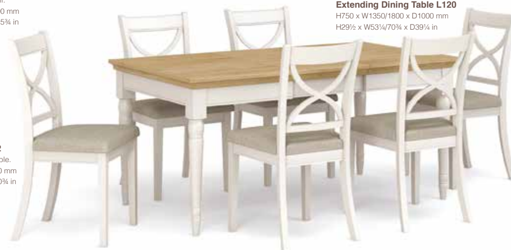
Dining Chair 122

H860 x W1040 x D400 mm H33¾ x W41 x D15¼ in