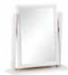
Vanity Mirror 174

H610 x W1000 x D25 mm H24 x W39¼ x D1 in