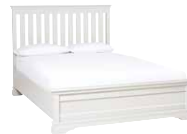
Imperial Bed Double LFE (4'6'') 241

H1250 x W1635 x L2185 mm H49¼ x W64¼ x L86 in