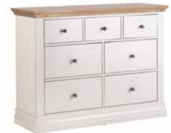
3+4 Drawer Chest 199

H1020 x W890 x D425 mm H40¼ x W35 x D16¾ in