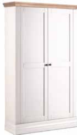
Narrow Wardrobe 224

Single hanging rail. H2030 x W1250 x D565 mm H80 x W49¼ x D22¼ in