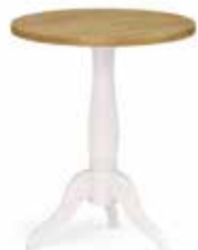
Side Table - Round L143

H810 x W1000 x D400 mm H31¾ x W39¾ x D15¼ in