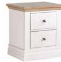
2 Drawer Bedside Chest 200

H1440 x W530 x D425 mm H56¾ x W20¾ x D16¾ in