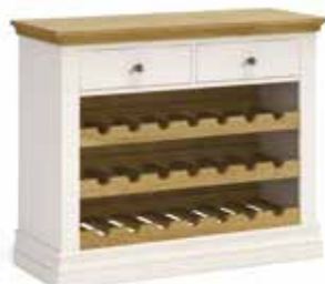
Wine Unit L137

H860 x W1040 x D400 mm H33¾ x W41 x D15¼ in