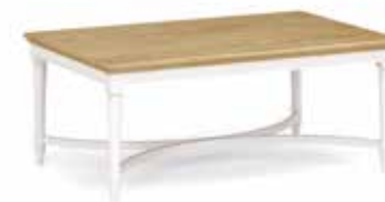
Large Coffee Table L142

Two drawer. They can be opened from either side. H480 x W950 x D550 mm H19 x W37½ x D21¼ in