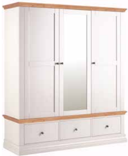
Triple Wardrobe with 3 Drawers 225

Two hanging rails. Two internal top shelves. H2020 x W1800 x D565 mm H79½ x W70¾ x D22¼ in