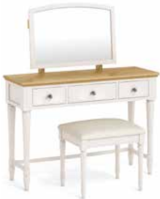
Dressing Table & Mirror Set 216

H950 x W1246 x D425 mm H37½ x W49 x D16¾ in