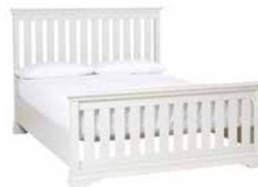
Imperial Bed King Size HFE (5') 242

H500 x W1040 x D500 mm H19¼ x W41 x D19¼ in