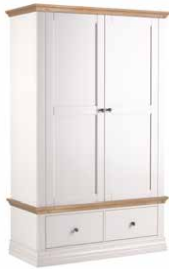
Double Wardrobe with 2 Drawers 223

Two hanging rails. Two internal top shelves. H2020 x W1800 x D565 mm H79½ x W70¾ x D22¼ in