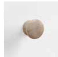
Wooden Button WL