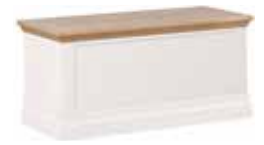
Blanket Box 220

H1250 x W1485 x L2070 mm H49¼ x W58½ x L81½ in