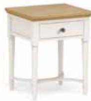
Lamp Table L140

H620 x W525 x D525 mm H24½ x W20¾ x D20¾ in