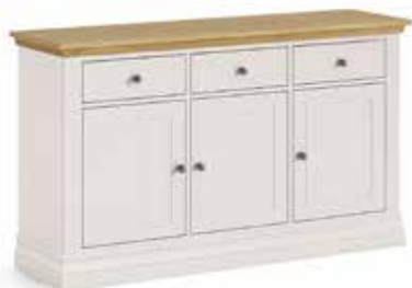
Large Sideboard L134

H420 x W1100 x D700 mm H16½ x W43¼ x D27½ in