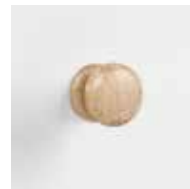
Wooden Button W