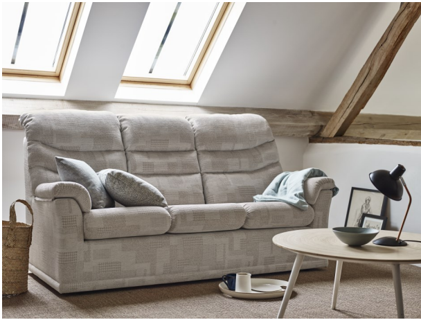
Malvern Fabric 3 Seater in Lydia Blush