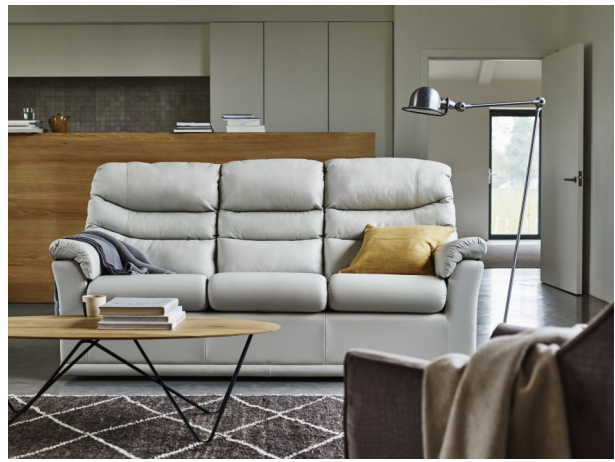
Malvern Leather in Capri Pearl

Launched at the January Furniture Show, the latest evolution of the much loved Malvern offers all the comfort of the current model with a fresh look for 2017. Showcased in Lydia Blush fabric and Capri Pearl leather, a range of updates ensure Malvern will continue to be a commercial success.