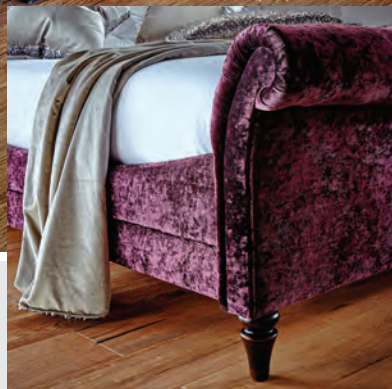
Kingsbury 5' King size Bed Frame: Fabric 1: Indulgence Grape